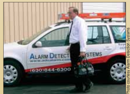
In the event of a false alarm, ADS personnel often visit the customer in an effort to avoid future issues.

Bonifas encourages other companies, big and small, to adopt these proven reduction